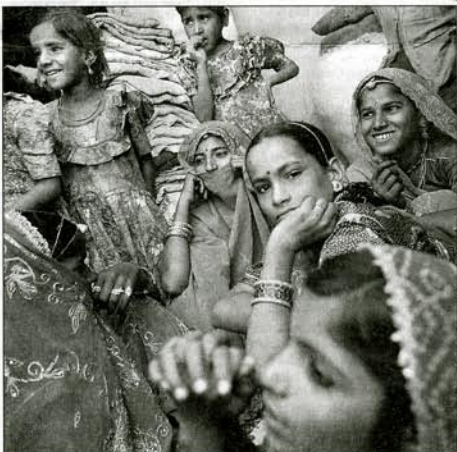
"Indian Women" is part of the Eric Breitenbach exhibit at the Southeast Museum of Photography at Daytona State College in Daytona Beach.

The monotone of Breitenbach's "Life Stories" is pitch perfect.