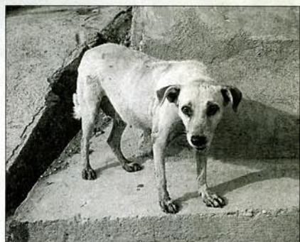
Southeast Museum of Photography